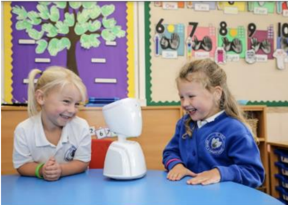
St Ives Primary School, Dorset

Dorset has a number of AV1s available for your school to help improve attendance.